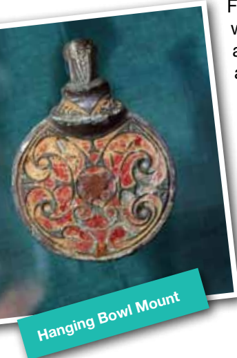
Hanging Bowl Mount