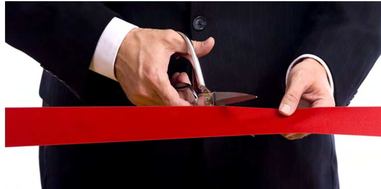
Ribbon Cutting Event