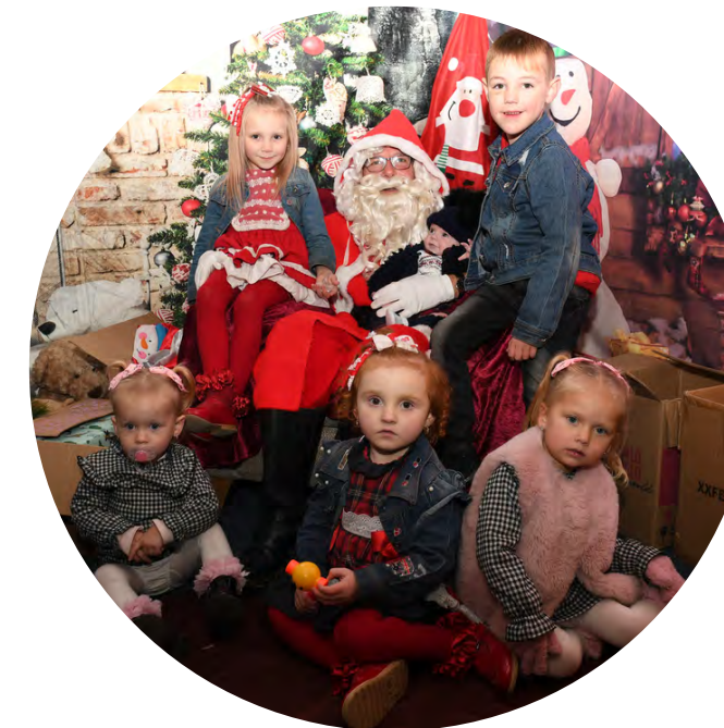
Christmas Lights Switch on 18/11/2023