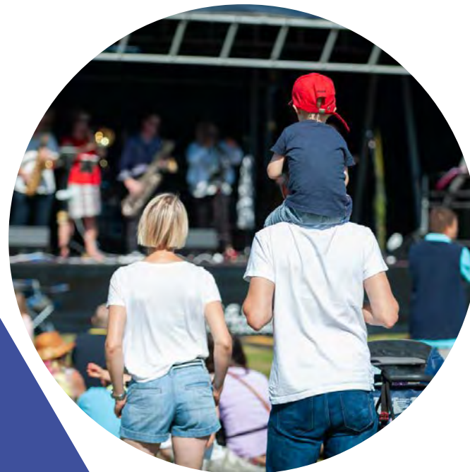
Town Show & Family Fun Day 09/09/2023