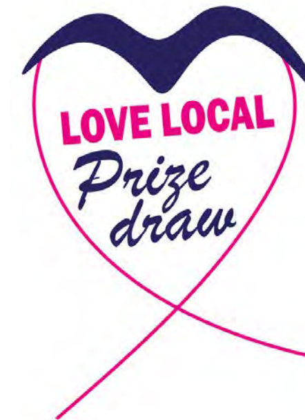
Shoppers' Prize Draw