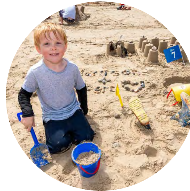
Sandcastle Competition 08/08/2023