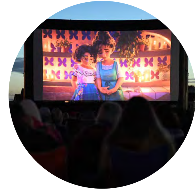
Screen on the Green 19/08/2023