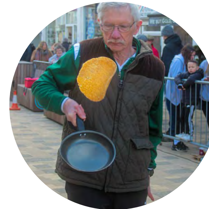
Charity Pancake Olympics TBC