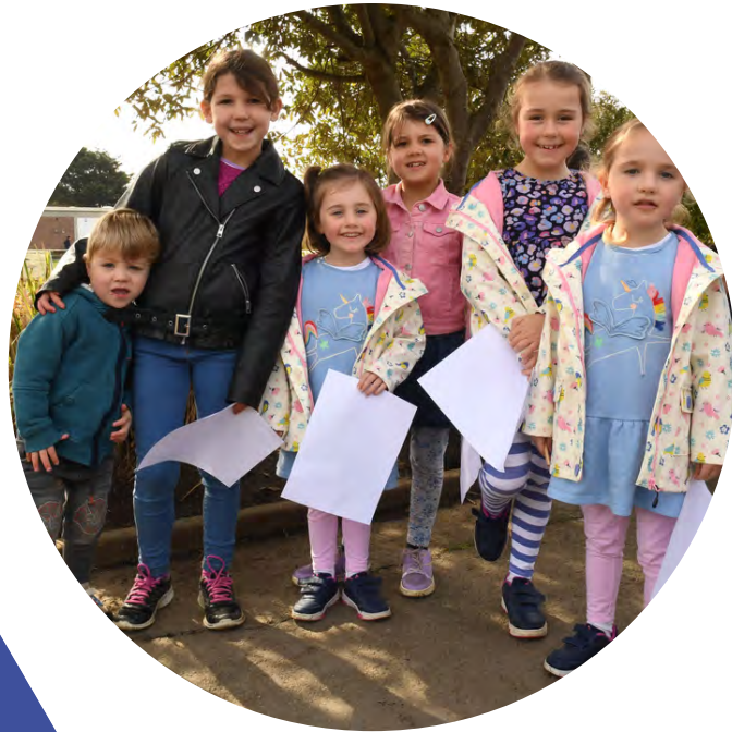
Easter Out & About 05/04/23 and 12/04/2023