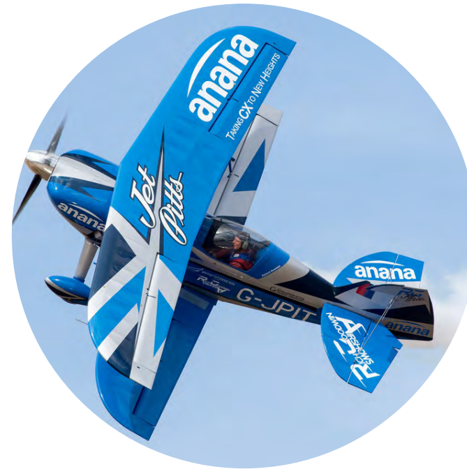
Armed Forces Day 24/06/2023