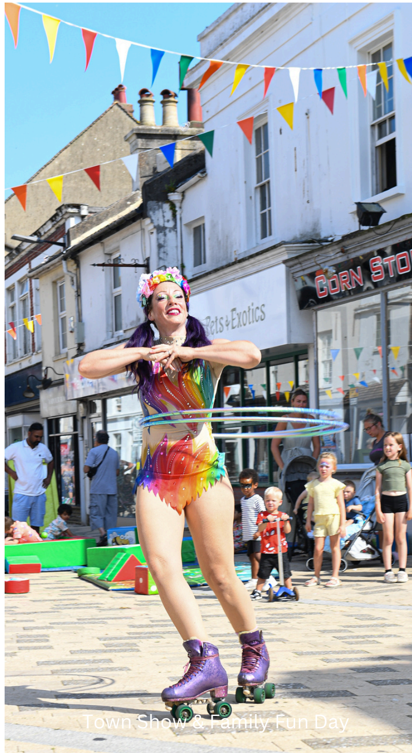
Town Show & Family Fun Day

All sponsorship types enable us to enhance the event experience for every attendee. It means that funds can be used to create memorable experiences that build on the reputation of the Town and its community. It can pay for event infrastructure, additional free entertainment, increased event marketing and many more.